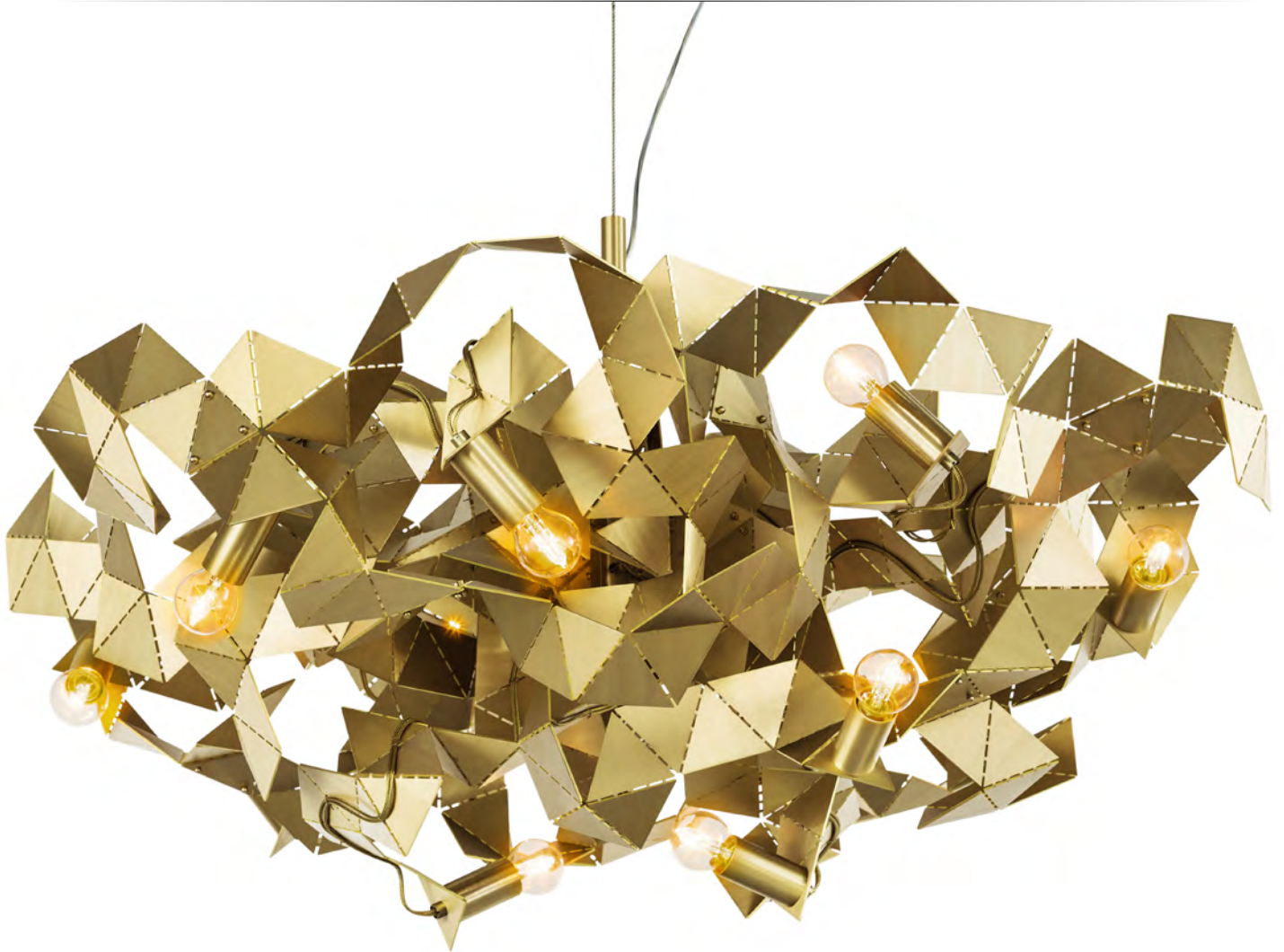
FRACTAL CHANDELIER ROUND FRACC100BRG