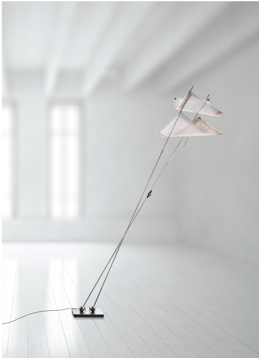
Dew Drops Floor INGO MAURER UND TEAM 2015

Transparent plastic sheet with integrated LEDs, metal. Two metal rods, adjustable via ball-joints mounted on a metal base (19 x 26 cm). With dimmable touch sensor switch on the sheet.